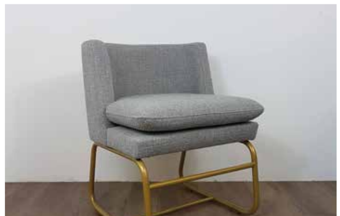
SLOANE DESK CHAIR